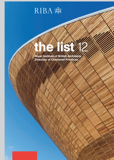
RIBA the list