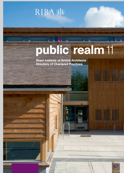
RIBA public realm